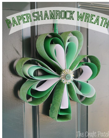
St. Patrick's Day Wreath (see over for instructions)